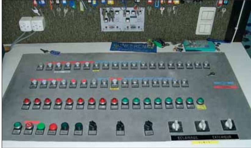
Figure 1. This is what the system control looked like before the retrofitting with the GePro control panel and the Elvis visualization. The connection and programming of the system is performed through Elvis in the background.

The School of Hotel Management Diekirch was equipped with a fire protection system and new safety technology based on the KNX system as part of a retrofit effort. The control of the corridor lights by motion detectors, the exterior light control by light sensors and timer and the linkage to the Elvis visualization system were installed. It was important to the planner to offer a simple and