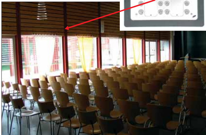
The 16x GePro Panel controls the large ballroom and the entire stage lighting system. This ensures a cost efficient and simple operation by the user or by actors on stage.